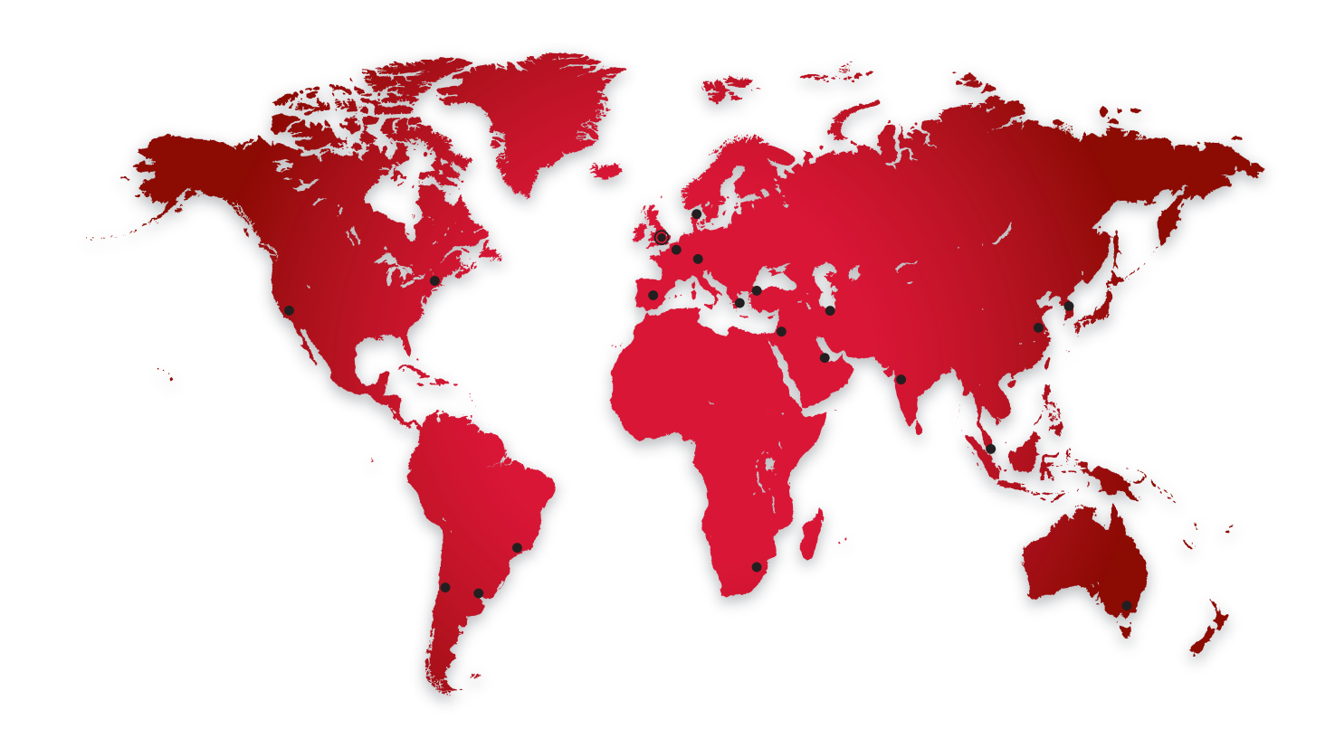
Asia • Europe • Middle East • Americas • Oceania • Africa